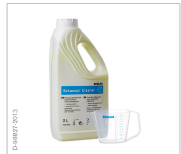
Sekusept® Cleaner Sekusept® Cleaner is a concentrated liquid cleaning agent for manual cleaning of respiratory masks, respiratory protection equipment, diving apparatus and chemical protective suits before disinfection.