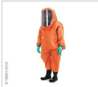
Dräger CPS 7900 This gas-tight suit provides excellent protection against industrial chemicals, biological agents and other toxic substances. Its innovative material also qualifies the CPS 7900 for work in potentially explosive areas as well as for handling cryogenic substances.