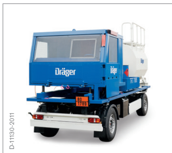
Dräger TRT 7000 Realistic, safe and repeatable training: The Dräger TRT 7000 allows you to prepare rescue personnel for complex truck accidents and Hazmat scenarios while reducing costs, logistical and environmental implications.