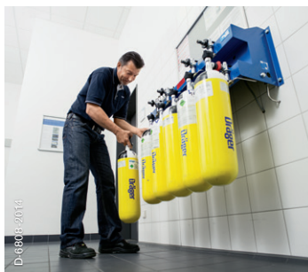
Filling, transport and storage Dräger's external filling panels make life easier in situations where the filling area and compressor cannot or may not be in the same room. Up to six cylinders can be filled at the same time.

Hygiene plays a pivotal role in protecting the health of breathing apparatus wearers. Moreover, it is also an essential factor for maintaining your equipment functioning properly and optimally. Dräger offers practical equipment alongside time-saving solutions for cleaning and disinfection. All the while supporting your processes for both manual and automatic cleaning.