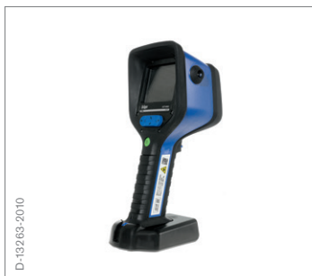
Dräger UCF® 9000 Always remain focused: The thermal imaging camera Dräger UCF® 9000 is thermal imaging and digital camera in one. It ensures you are well equipped even for complex tasks – from search and rescue operations to detection of spills or leakages.

Bringing medical care to injured persons is what patient rescue is all about – as gently and quickly as possible. Dräger's leading-edge medical equipment supports the patients' vital functions during rescue and transport to hospital. Because every second counts.