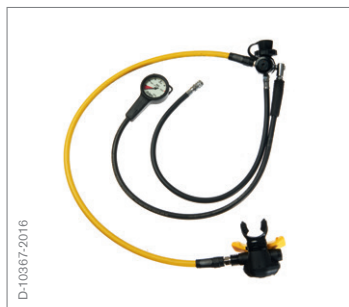
Secor 7000 First stage: Three HP ports and five MP ports to give highest flexibility in configuration. Second stage: Simple cleaning because the second stage can be opened without tools.

open SCUBA system is the regulator aside the full-face mask and the carrying system. Accessories like a residual pressure warning device, communication equipment or safety lines enhance the situational awareness and therefore the safety of the divers.