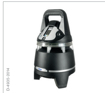
Dräger X-zone® 5500 The Dräger X-zone® 5500 transforms the Dräger personal gas detection instruments X-am® 5000, 5100 and 5600 into innovative area monitoring devices.