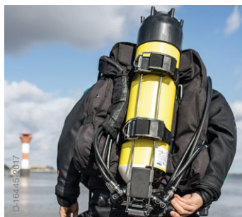
PSS® Dive Carrying system and BCD Modular system: The PSS® Dive carrying system can be used with or without the buoyancy compensation system. It contains large weight pockets allowing the PSS® Dive harness to carry double the weight of 6 kg. Weight pockets are easily accessible in emergency situations.