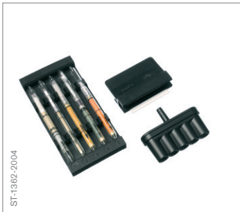
DrägerTubes More than 180 DrägerTubes are available to measure the spot concentrations of specific gases. They can be used in pipelines, gas installations, in sewers, mine shafts and other confined spaces.

It is not enough to know that a hidden danger exists; you have to know precisely where it is. This requires you to know the exact location of a gas leak or the filling level in a tank. Thermal imaging cameras provide reliable and quick support in such instances. Robust and user-friendly, they provide vital information regardless of smoke, darkness or other challenges.