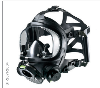
Panorama Nova Dive Full-face diving mask with non-fogging visor, 3 external connectors, nose clips for pressure equalisation, and head harness with quick-release levers.