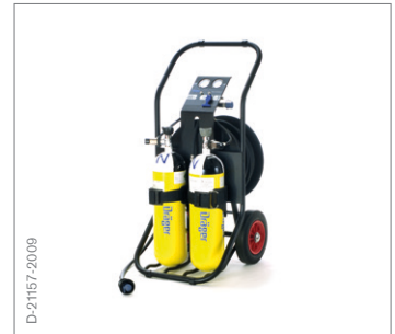
Dräger PAS AirPack The PAS Dräger Airpack 1 unit can be used for tasks of long duration. It possesses between one and four compressed air cylinders and cylinder sizes ranging between 6L and 12L (200 or 300 bar).