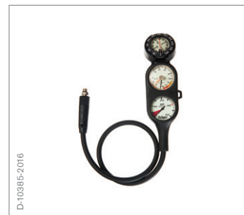
Many options even for hoses and consoles The Secor 7000 has a wide range of hoses available to use – hose varieties range from classic to coupled or flexible hoses. There is also a full range of different consoles at hand.