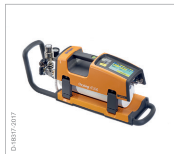
Dräger Oxylog® VE300 The straightforward and user-friendly Dräger Oxylog® VE300 is built to face your challenges in preclinical emergency services. With reliable ventilation technology, robustness and intuitive operation, it provides you with dependable and safe assistance in an emergency.