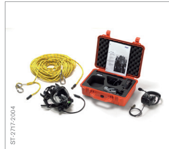
Dräger UT 402 Underwater communication: Complete package for surface and diver. Easy to use. Easy connection to one of the ports of the Panorama Nova Dive. Communication line available in 50 and 80 m length.