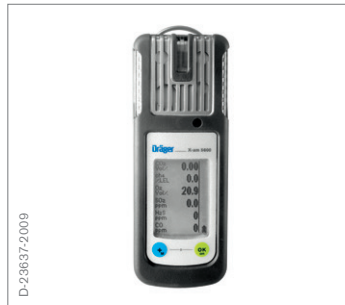
Dräger X-am® 5600 Featuring an ergonomic design and innovative infrared sensor technology, the Dräger X-am® 5600 is a robust, watertight and 1 – 6 gas detection instrument, which provides accurate, reliable measurements of explosive, combustible and toxic gases and vapours as well as oxygen.