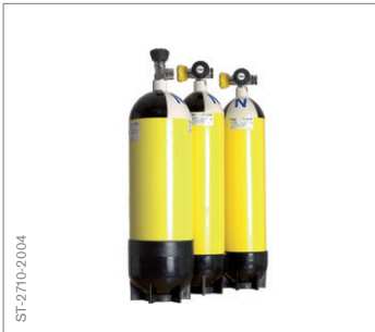
Compressed air cylinders Full range of SCUBA diving cylinders with Mono or Duo Valves. Available as single cylinders and cylinder double packages, 200 and 300 bar technology.

the night, during inclement weather, in zero visibility, such as in “black water”, or in waters contaminated by chemicals and biohazards. As a fire service diver you need to rely on your equipment.